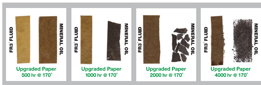
Insulation aging study comparing thermally upgraded paper using FR3 fluid vs. mineral oil.

Insulation paper is one of the primary factors that determines the life of a transformer. FR3™ fluid's unique chemistry absorbs free water and essentially wicks it away from the insulation paper. FR3 fluid has over 10 times the water saturation level of mineral oil. This results in extending the insulation life 5-8 times longer than mineral oil.